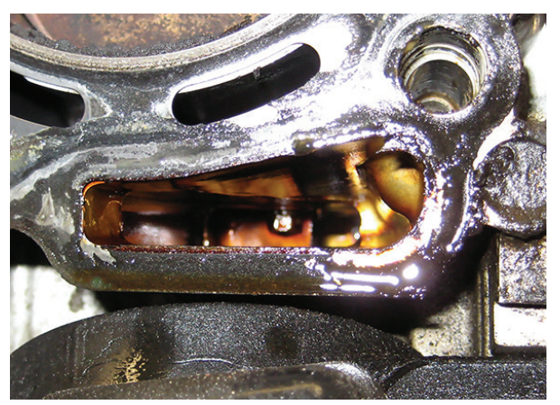
Head gasket damage, resulting in external leak